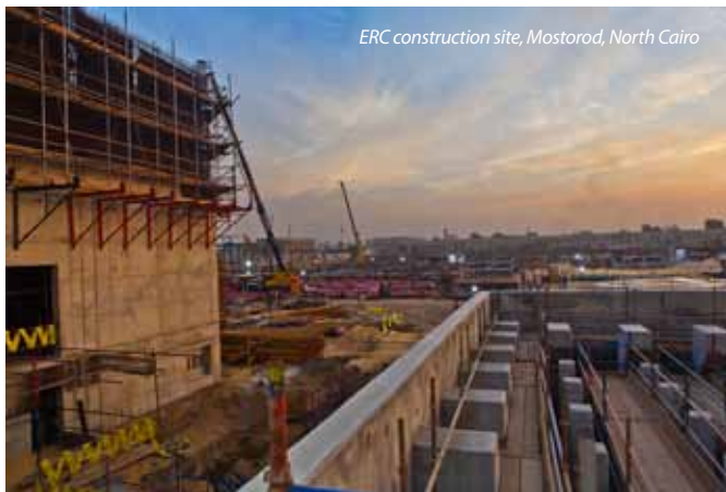
ERC construction site, Mostorod, North Cairo