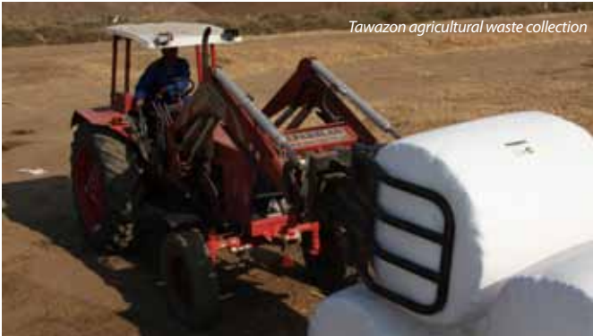
Tawazon agricultural waste collection