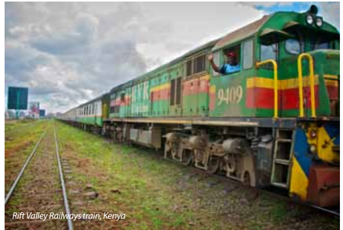
Rift Valley Railways train, Kenya