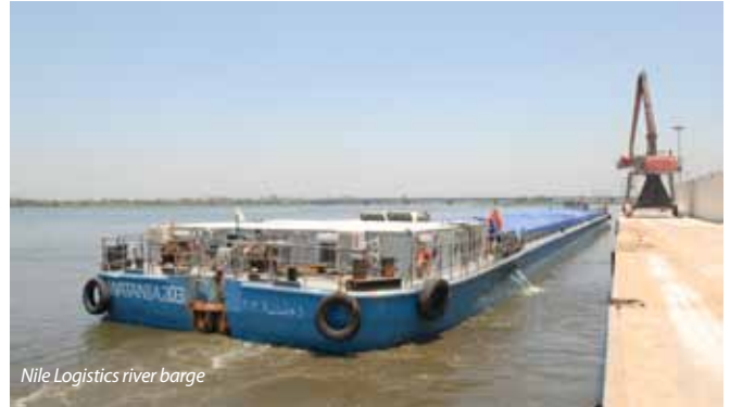
Nile Logistics river barge

Qalaa Holdings' involvement in a diverse array of sectors, ranging from industry to infrastructure, has had a significant impact on the economics of the region. We prize innovation, value creation and sustainability in all of our investments from solid waste management to river transport and rail.