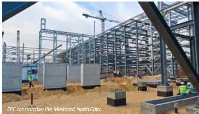
ERC construction site, Mostorod, North Cairo

Qalaa's subsidiaries work each day to deliver energy to consumers and businesses alike to grow safe, healthy food, provide reliable, fuel efficient transportation solutions, add value to natural resources, and help build critical national infrastructure.