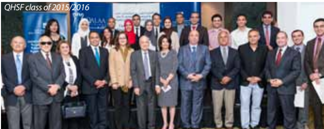
QHSF class of 2015/2016

Our scholars represent a diverse cross-section of Egyptian society