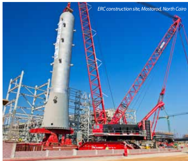
ERC construction site, Mostorod, North Cairo