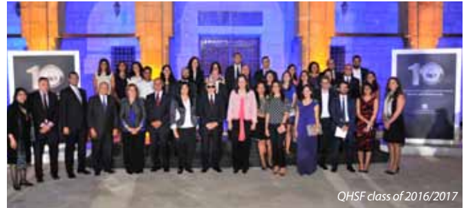
QHSF class of 2016/2017

Since 2007, the Qalaa Holdings Scholarship Foundation (QHSF) has awarded 151 of Egypt's brightest students full scholarships to pursue graduate studies abroad at leading global universities in the US and Europe.