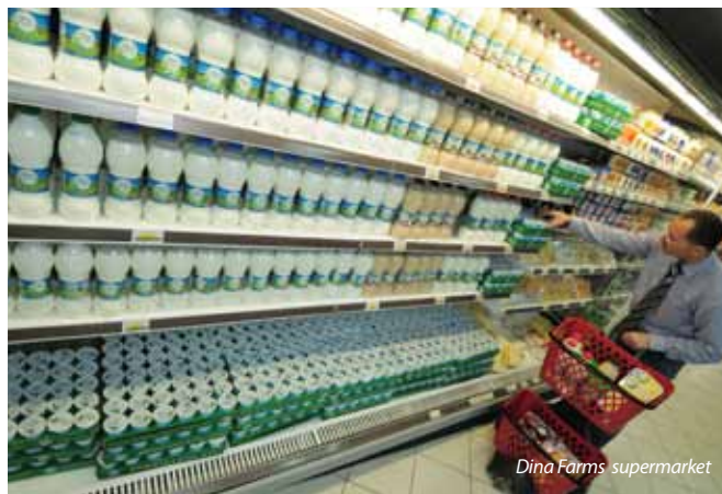
Dina Farms supermarket