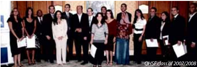
QHSF class of 2007/2008