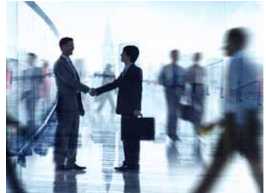
The American University in Cairo (AUC)

In 2006, Qalaa Holdings established the Qalaa Holdings Financial Service Center (QHFSC) at the American University in Cairo. A first of its kind in the region, it provides financial education at a state-of-the-art facility, integrating hands-on financial practices with financial concepts. QHFSC has benefited over 2,738 students, invested USD 180 million in databases and software programs and provided over 300 training workshops.